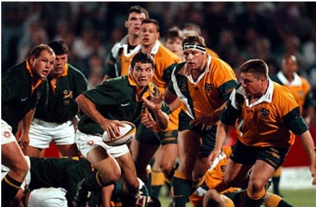
Figure 1. A rugby team also uses Scrum Meetings (not shown here).

Each Sprint operates on a number of work items called a Backlog . As a rule, no more items are externally added into the Backlog within a Sprint . Internal items resulting from the original pre-allocated Backlog can be added to it. The goal of a Sprint is to complete as much quality software as possible, but typically less software is delivered in practice (Worse Is Better pattern). The end result is that there are non-perfect NamedStableBases delivered every Sprint .